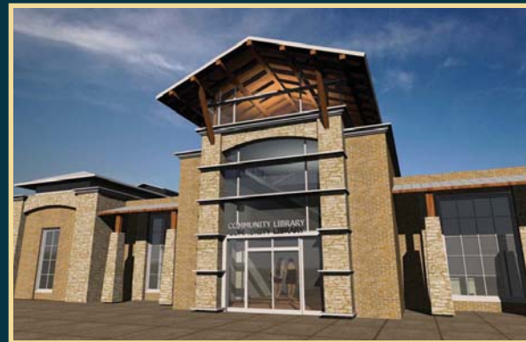
The John and Judy Gay Library -Artist rendering

“... no man is useless while he has a friend.” - Robert Louis Stevenson